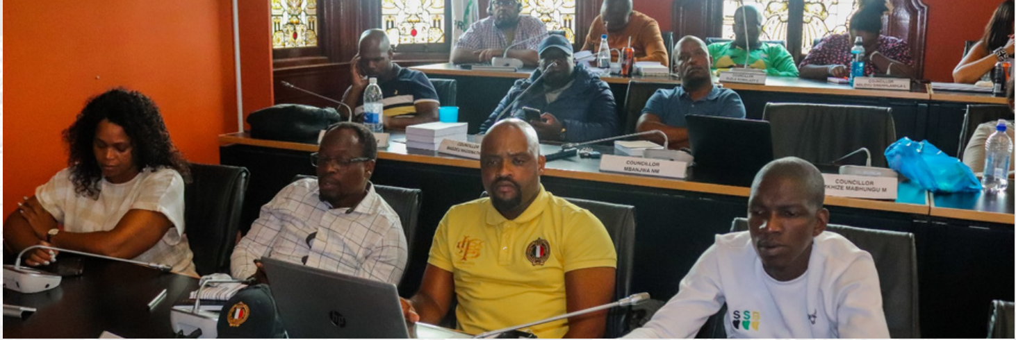
Councillors attended the workshop on the preferential procurement and military veterans policies held at the Council Chamber